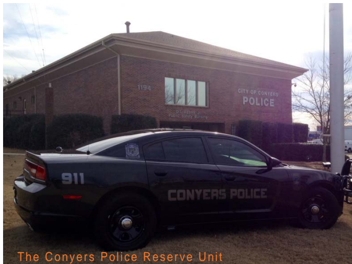
The Conyers Police Reserve Unit

Is a volunteer, not for profit organization designed to support the Conyers Police Department in areas of patrol, special events, community outreach, and several other divisions within the agency. Our goal is to provide our citizens with the highest quality of public services